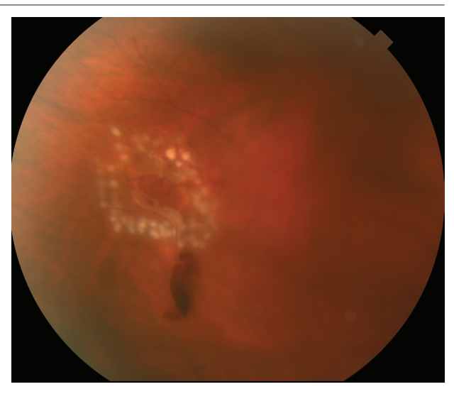
Laser photocoagulation around retinal tear with small hemorrhage.

However, in people who have an inherently more "sticky" vitreous, as the vitreous separates from the retina, it pulls abnormally (abnormal vitreo-